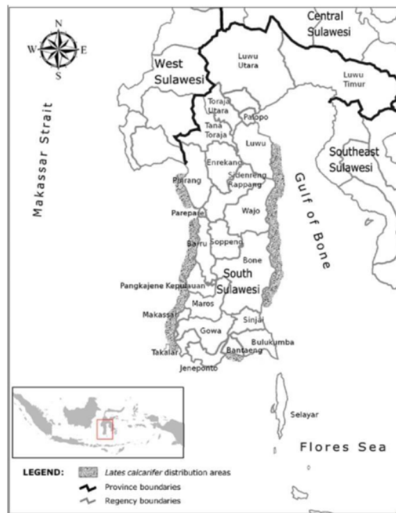
Figure 1. Distribution of Asian seabass, Lates calcarifer Bloch, 1790 in South Sulawesi waters

Information on the distribution and presence of Asian seabass populations, as described above, is very important for managing and conserving Asian seabass populations in their natural environment. In addition, the distribution map will also be very useful for sourcing broodstock for Asian seabass aquaculture, which is currently starting to develop in Indonesia, including in South Sulawesi.