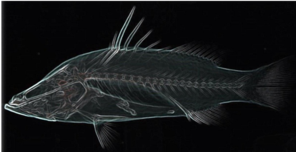
Figure 2. X-ray showing meristic characters of Lates calcarifer Bloch, 1790 from South Sulawesi coastal waters